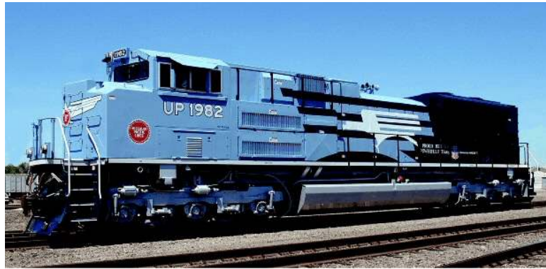
This is the new UP MoPac Heritage locomotive UP painted and released on July 30, 2005 (see story elsewhere in this issue)