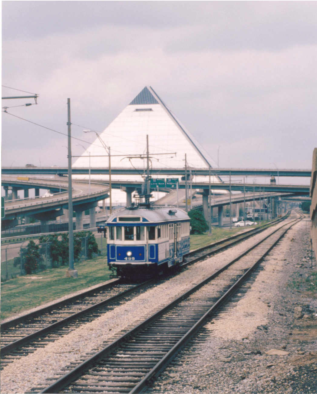
MATA 455 and Pyramid River Line, Memphis, TN, April 30, 2005.

Arkansas Railroader - Little Rock Chapter NRHS