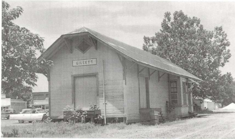
Cotton Belt depot at Gillett, Arkansas, July 1970.

Send check, made out to the Arkansas Railroad Club, PO Box 9151, North Little Rock AR 72119. Call 501-758-1340 for more information or visit us on the web at http://www.trainweather.com and click on Arkansas Railroader . Our email is trains@trainweather.com .