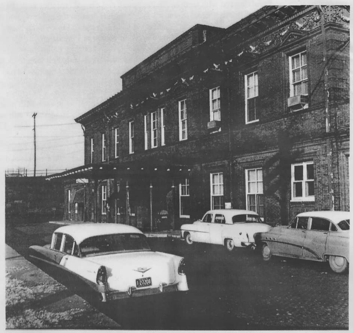
The fine passenger station at East Second & McLean Streets in Little Rock was not complete in time for the first passenger train. It was ready for full use during the first week of Aug. 1900.

It was built of pressed brick and ornamental terra cotta and was 55' x 160'. There was a covered concrete platform, 15 feet wide, along the tracks on the east side. On the west side (shown above) was a brick paved drive with ample room for omnibuses and express wagons. (Author's 1956 Bel Air Chevy in foreground). The earth embankment at the end of the station is the approach to the Second Street viaduct spanning the tracks.