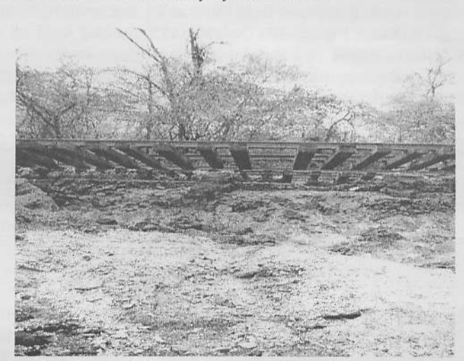
LEFT - Small trestle at milepost 364 and damage from massive flooding. RIGHT - A&M mainline dangling after washout at Winslow, Arkansas April 24, 2004.