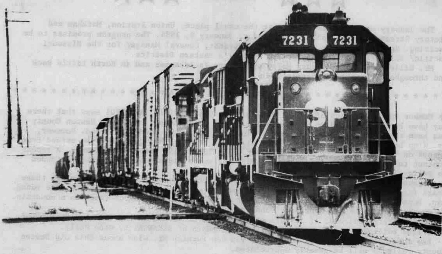
A Southbound Cotton Belt Manifest with an Elephant-Ear'd GP-40X #7231 leading the pack, slams across the Rock Island diamond at Brinkley, Arkansas. A train of Auto Parts follows. This year the ARKANSAS RAILROADER will present a guide to Cotton Belt Trains, along the lines of this year's Guide to MoPac Trains, along with many other features and items of interest.