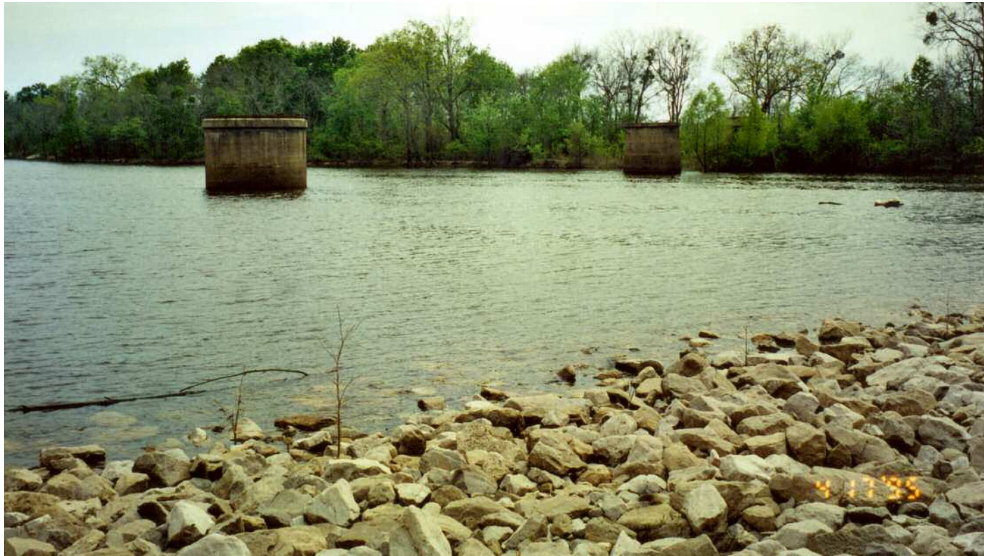
Undated photo of Missouri Pacific bridge piers east of Felsenthal, Arkansas, on the Ouachita River. and made probably in the 1990's. Site is now covered by a dam.