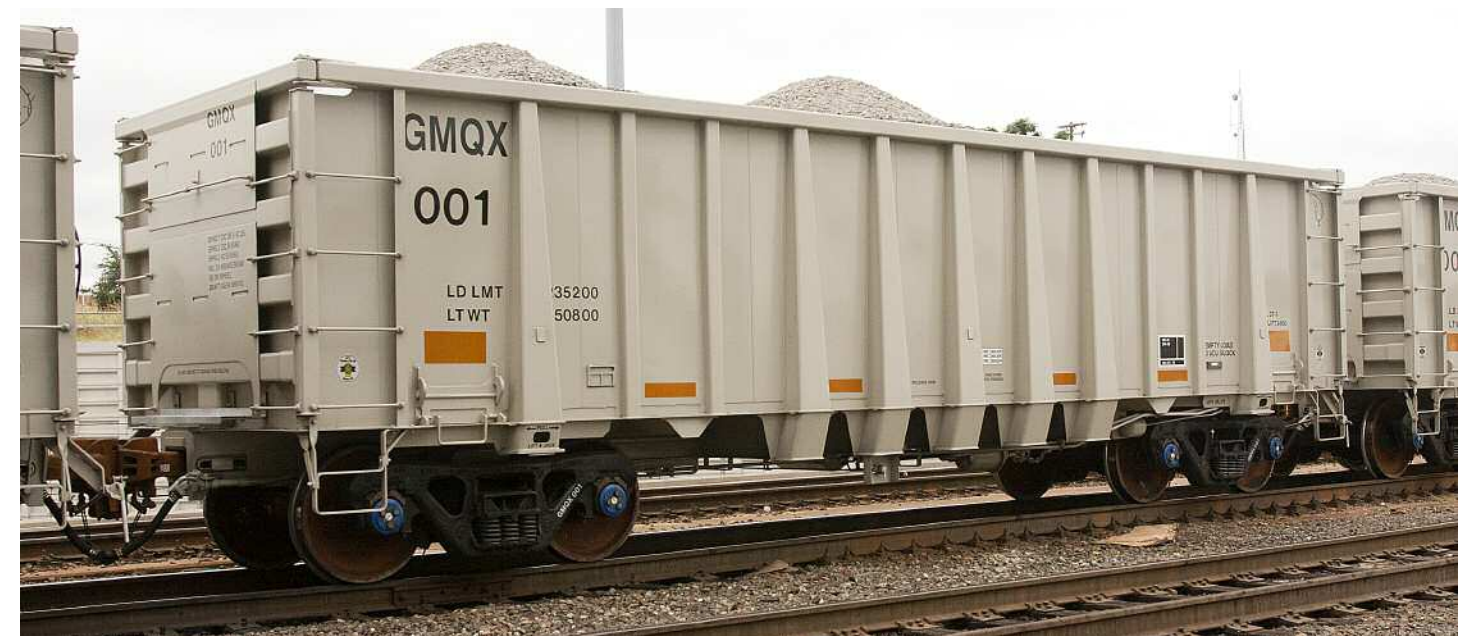
Granite Mountain Quarry has purchased 105 A-gons. The gondolas will be used to haul aggregate material. Here GMQX 001 is seen in Shreveport, Louisiana, on the Union Pacific.