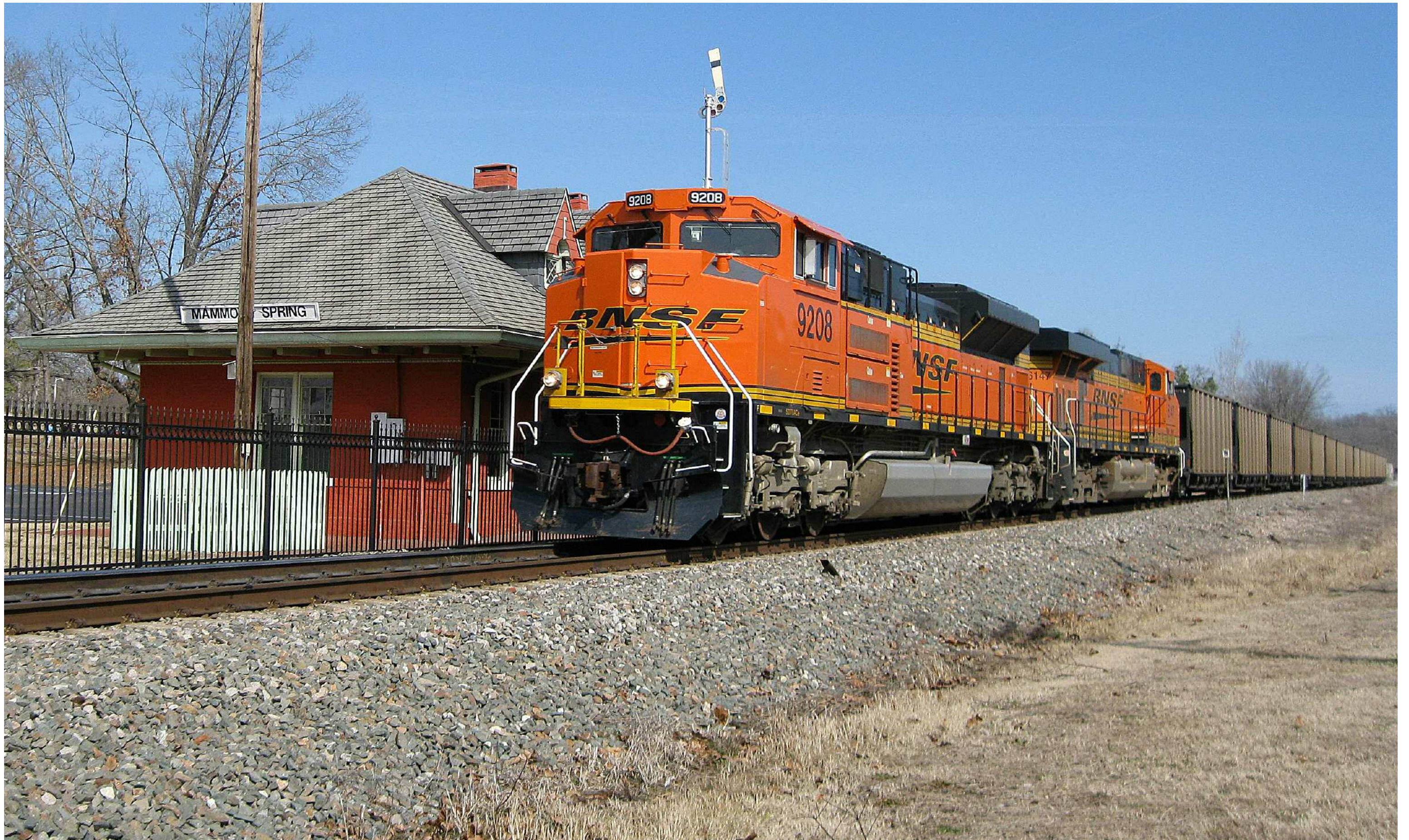
BNSF Railway coal train passes the former St. Louis-San Francisco depot at Mammoth Spring, Arkansas.