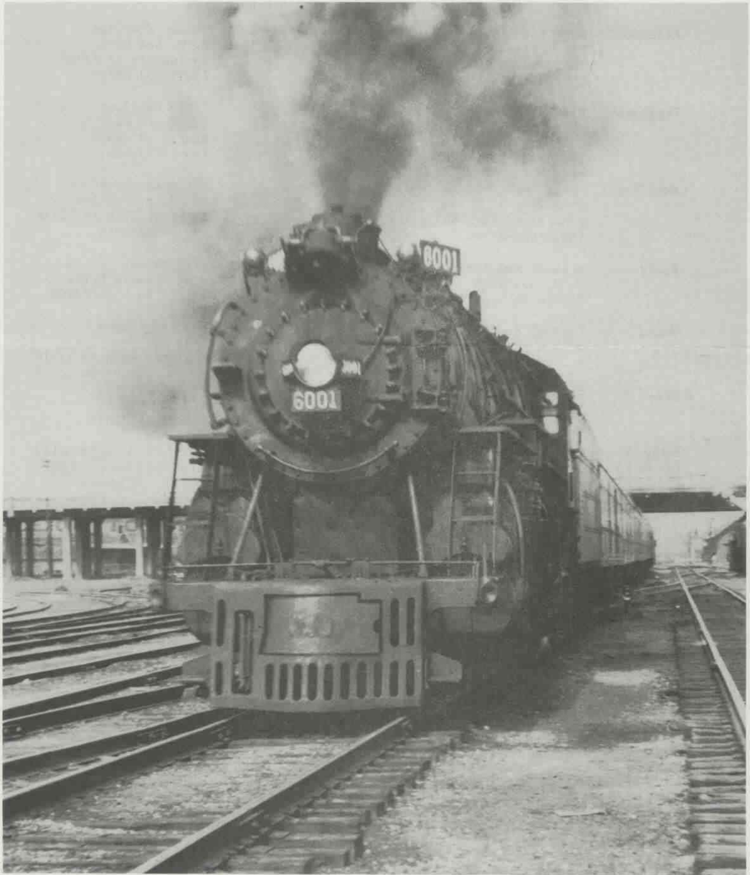
The MADAM QUEEN (Missouri Pacific 4-6-2 number 6001) heads MoPAC's Mail and Express Train Number 8 northbound through North Little Rock's rail yards in the busy war month of June 1943. (see story on Page 3)